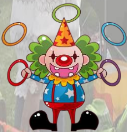
CIRCUS SKILLS WORKSHOP