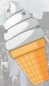
HOT and COLD FOOD